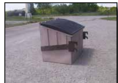
Low front for easy access