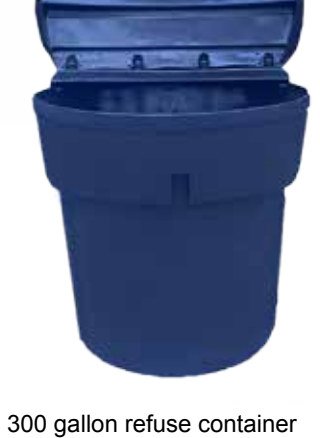
with full split lid