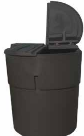
Refuse container with 50/50 Split Lid

Snyder Industries refuse containers set the industry standard for refuse, recycling, and yard waste collection - offering two innovative style lids; the 2/3<sup>rd</sup> lid design is of a single wall construction to offset lid weight but allows for use of larger refuse bags. The 50/50 split lids have a smaller opening for commonly used refuse bags but designed with a durable double wall construction. Lids were designed to be interchangeable with the 200, 300 and 450 containers and to retrofit other containers in the market.