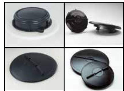
Multiple Top Lid Options and Accessories