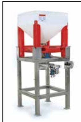
Discharge Stations are designed to provide dust free transfer of dry materials. Options include screw conveyors and vibratory feeders.