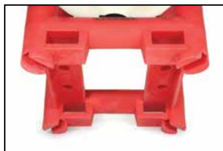
Sanitary Base Design