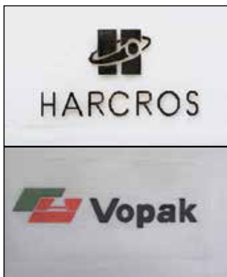
Molded-in Company or Product Information can be permanently embossed with proprietary company information.