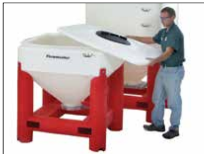
Open and Closed Top Designs Multiple top opening configurations are available to meet specific application requirements.