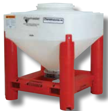
No top lift design with 22" sanitary lid.

Multiple Valve Options - including: • Butterfly valve • Sanitary Butterfly valve • Iris valve • Slide Gate • Other