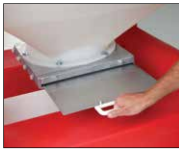
Aluminum Slide Gate