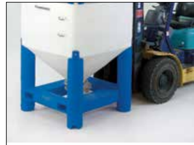
Optional Base Colors Thick walled, all-plastic base is available in a variety of colors to help designate specific application.