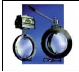
Sanitary Butterfly Valves