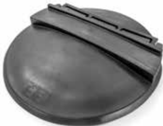
70/30 Lid Closed