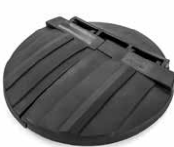
50/50 Lid Closed