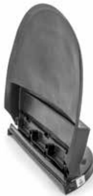
70/30 Lid Open