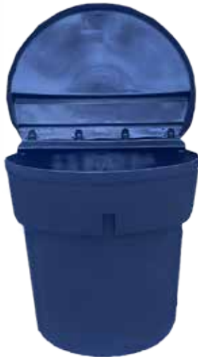
300 gallon refuse container with full split lid