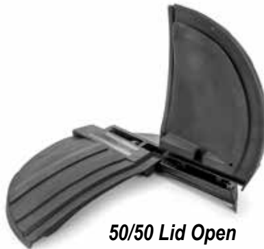
50/50 Lid Open