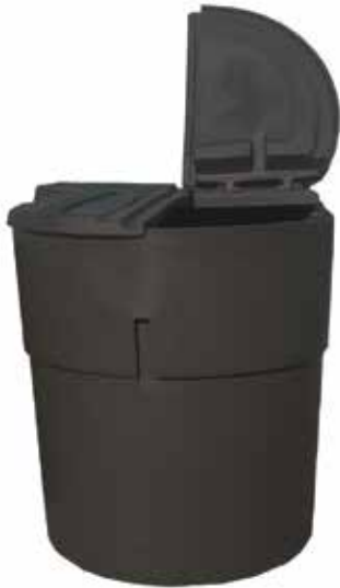
Refuse container with 50/50 Split Lid