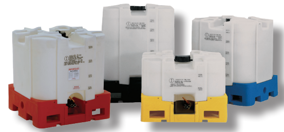
Snyder IBC pallets are available in different configurations and colors to meet a variety of application requirements.