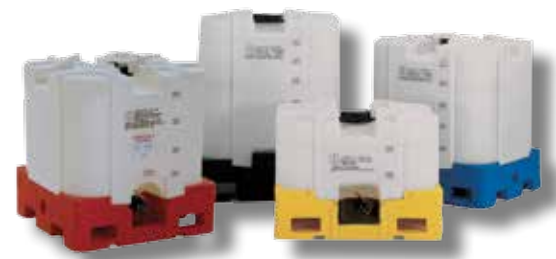
Snyder IBC pallets are available in different configurations and colors to meet a variety of application requirements.