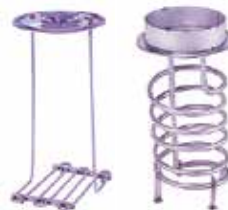
Heating Coils: Base Coil; Cork Screw Coil w/protective collar