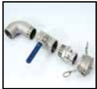
Standard 2" Ball Valve. Other optional sizes available.

A wide variety of options and accessories enables you to customize your Supertainer to your application and your budget.