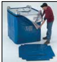
Insulation Blanket with optional heating elements for all Supertainer sizes.