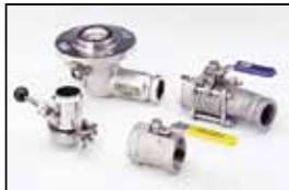
Valve Options Sanitary, Ball Butterfly