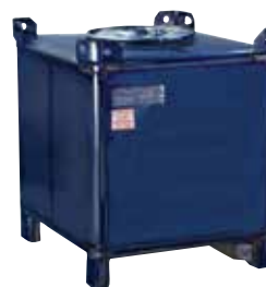
Supertainer is available in carbon steel.