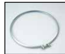
Drum Lid Clamp Rings Bolted & Lever-Lock Styles