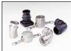
Quick Connect Adapters