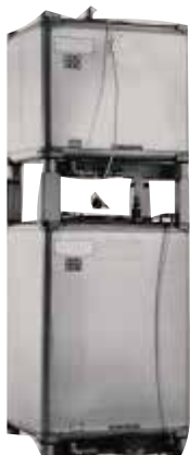
All Snyder IBCs are available with stacked discharge feed systems that allow the top tank to drain into the bottom tank.