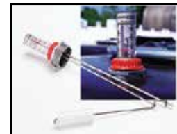
At-A-Glance Gauge: designed for long-life and easy readability. "At-A-Glance" liquid level indicator.