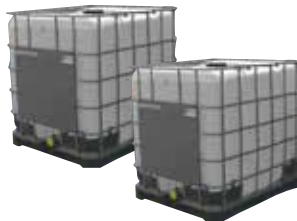
2 Limited Use IBCs