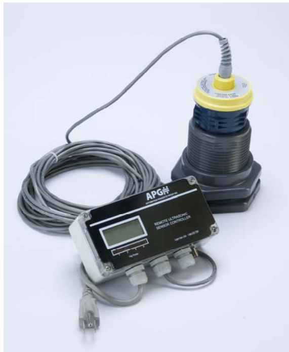
plug-in cord shown in picture is not provided with the system